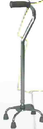
Aluminum Offset Quad Cane (Small Base)