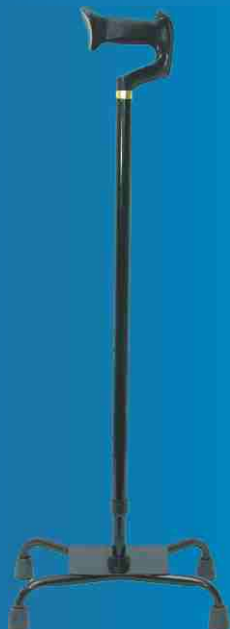
Orthopedic Handle Quad Cane (Large Base)