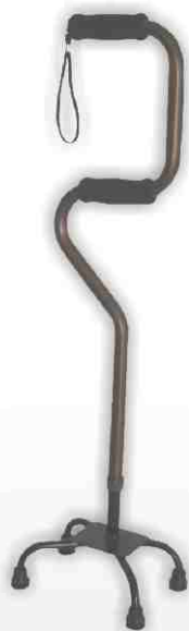
Arise Quad cane