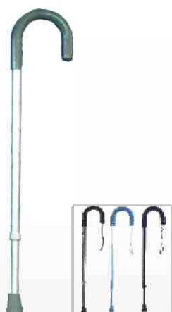
Half Round Handle Cane (Candy Cane)