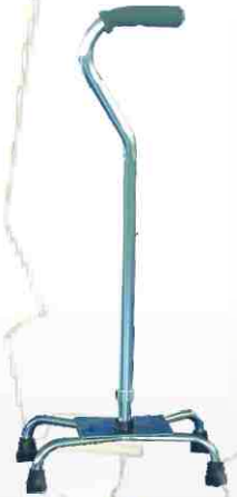
Aluminum Offset Quad Cane (Large Base)