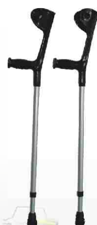
European Style Forearm Crutches