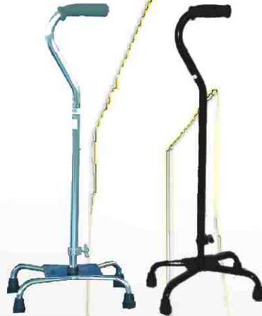
Deluxe Lightweight Quad Cane (Large Base)