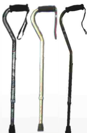
Offset Canes (Question Mark Canes)