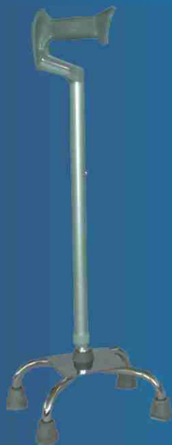
Orthopedic Handle Quad Cane (Small Base)