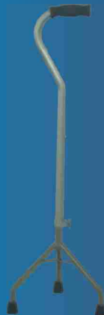
Offset Tripod Cane