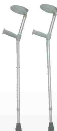
European Style Forearm Crutches