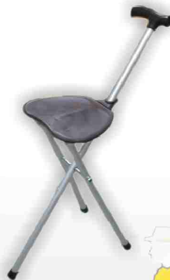
Tripod Cane seat