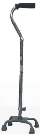
Profile Base Quad Cane (Small/Low Base)