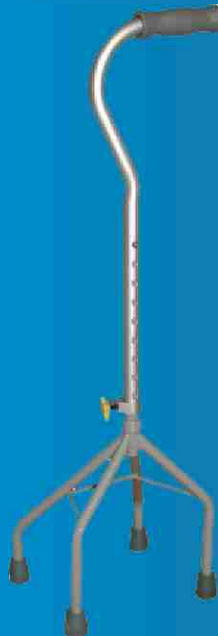
Imperial Collection Quad Cane